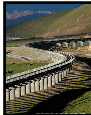
Longest Plateau Railway Qinghai-Tibet Railway