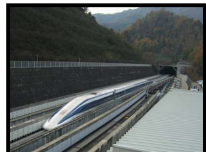
World's Fastest Train Shanghai's Maglev