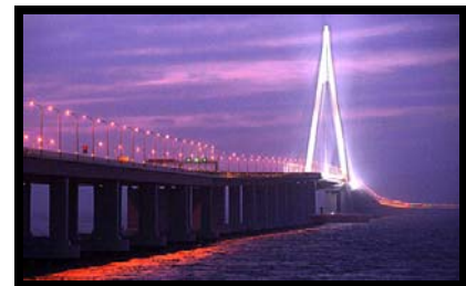
Longest Trans-oceanic Bridge Hangzhou Bay Bridge